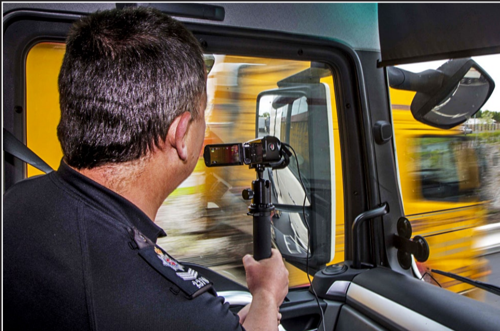
On the lookout: An officer in the police lorry during the trial of the in-cab video camera

Undercover officers pose as truckers to trap drivers who text and phone at the wheel