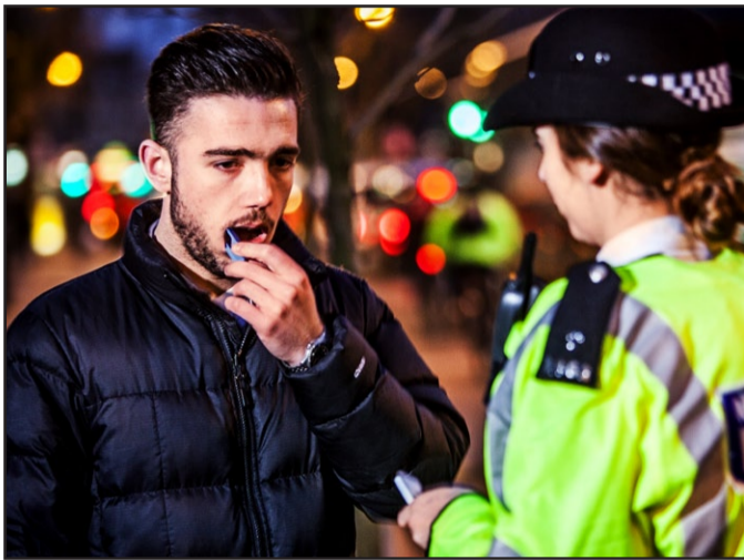
Roadside: Police will take saliva to test in a 'drugalyser'