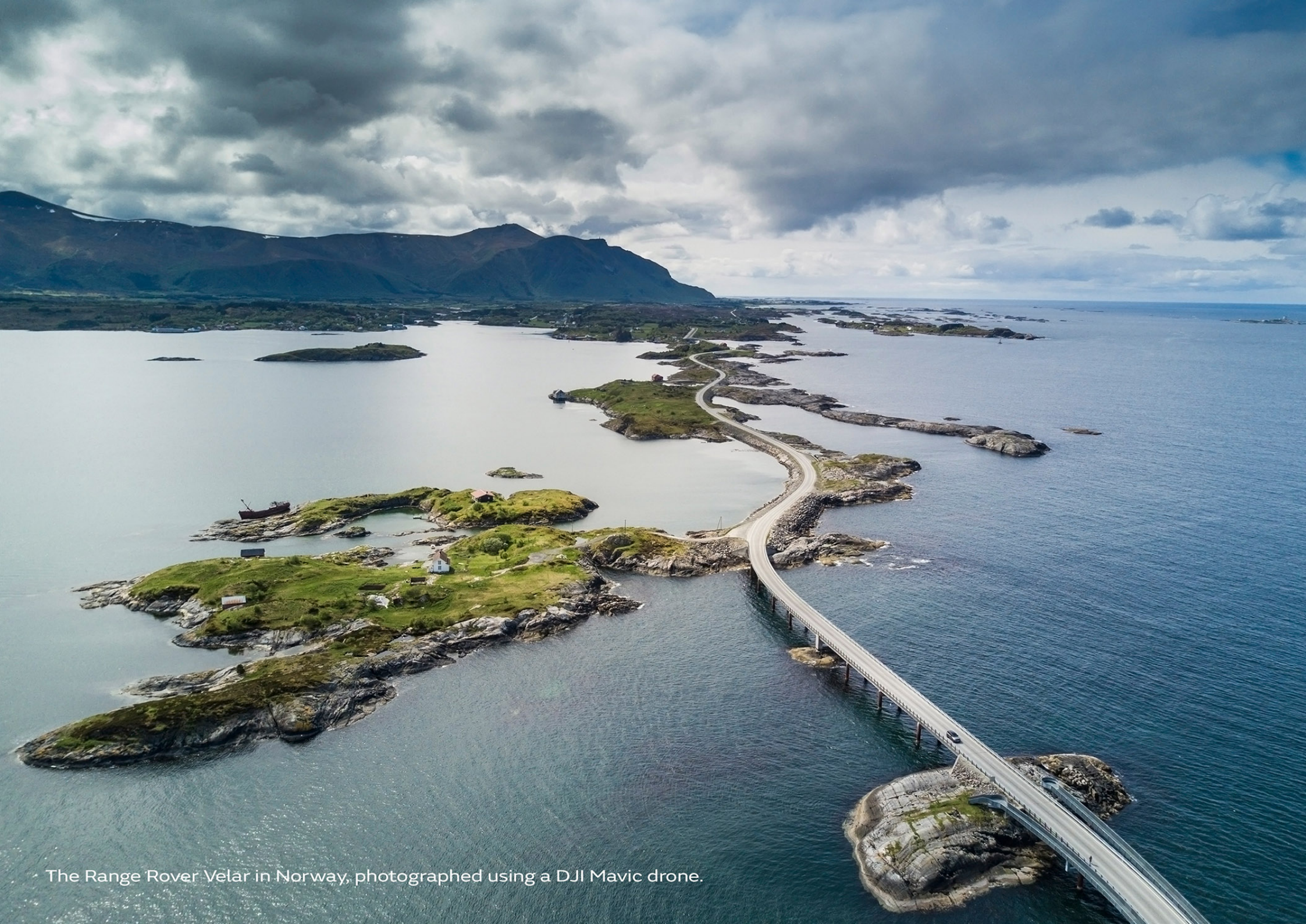
The Range Rover Velar in Norway, photographed using a DJI Mavic drone.