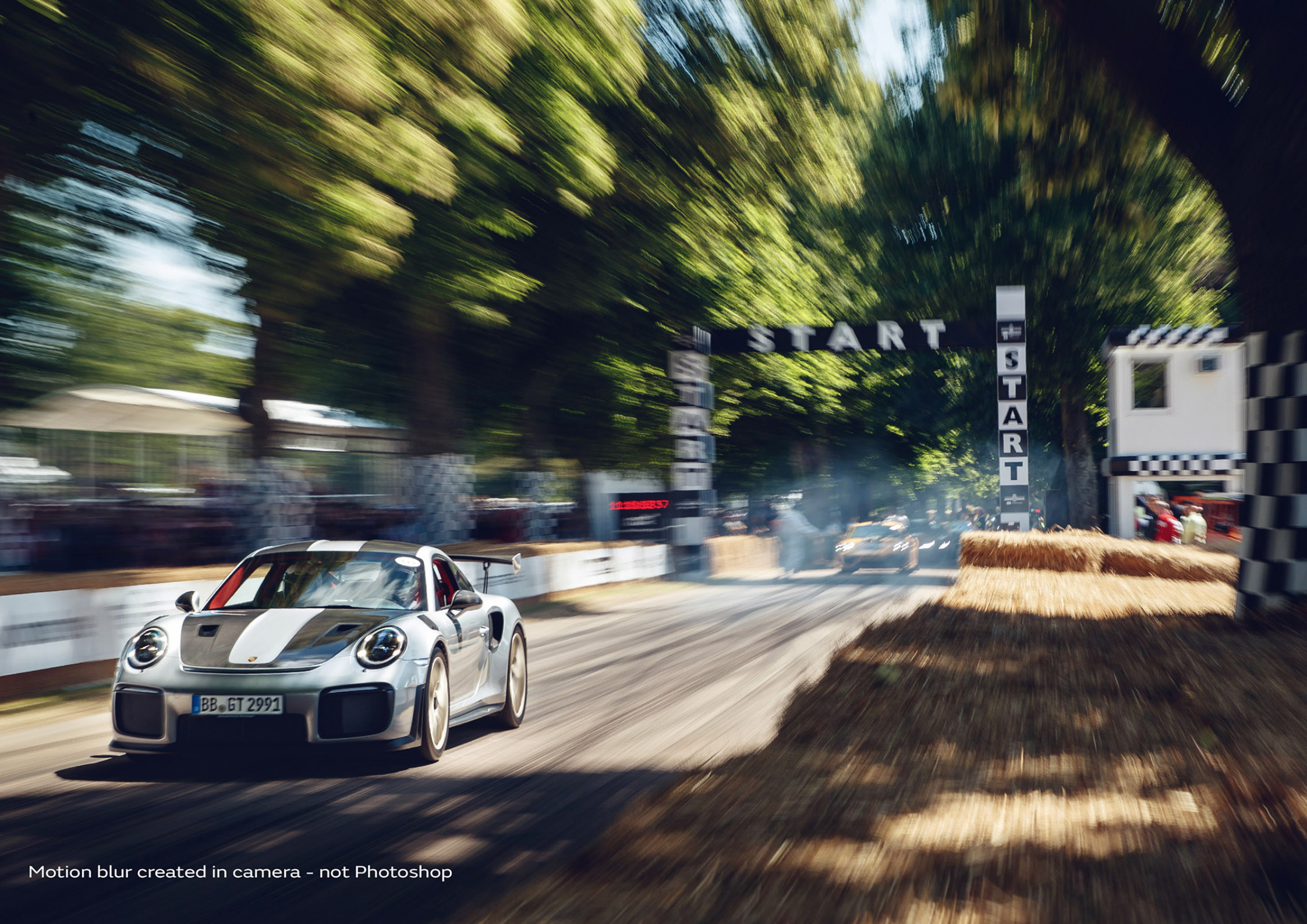
Motion blur created in camera - not Photoshop